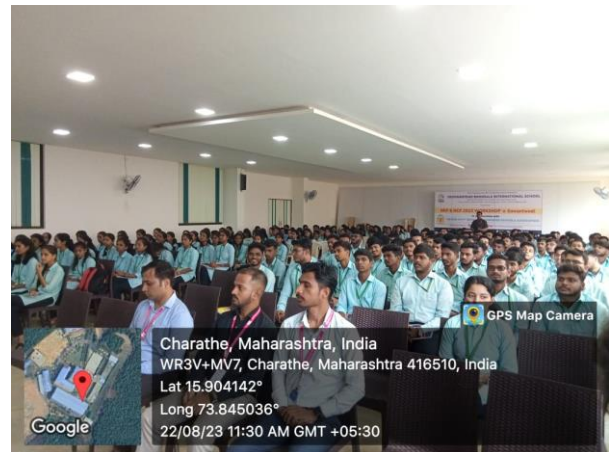
Students & Faculty Audience