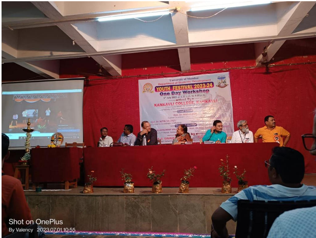
Glimpse of One Day Workshop: 56 th Intercollegiate Youth festival Organized by University of Mumbai