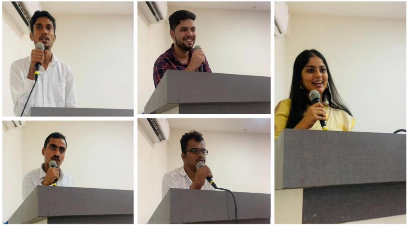
Alumni Interaction with staff and juniors, wherein they shared their workplace experience and expressed gratitude towards YBCP