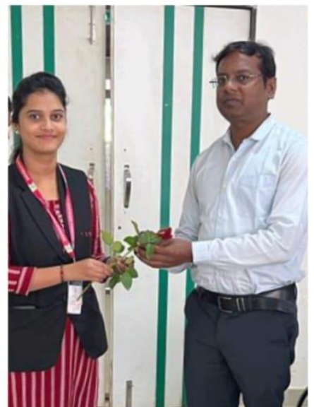
Guests were greeted with floral bouquet