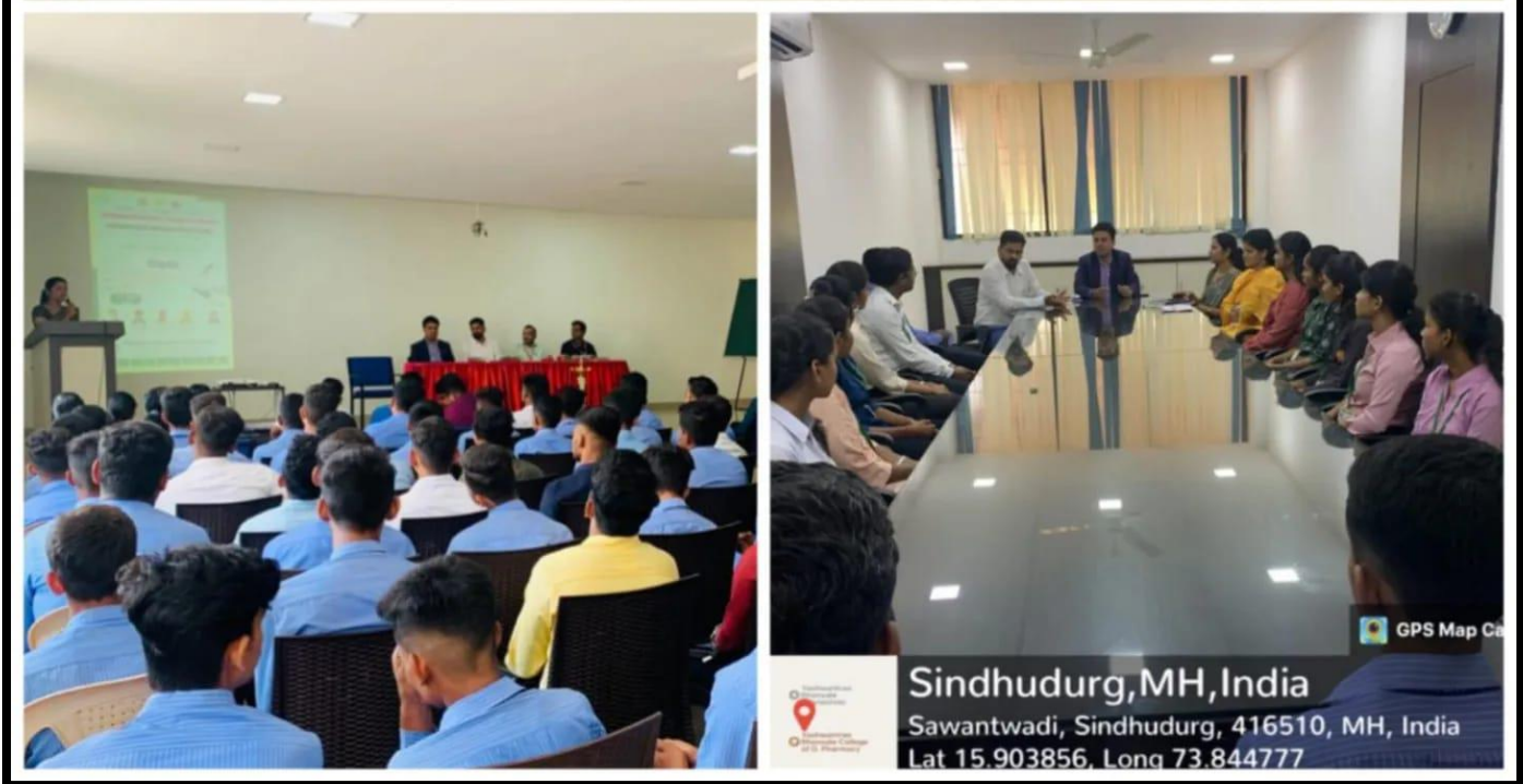
Interview session held by HR Team and Discussion with selected students by HR team