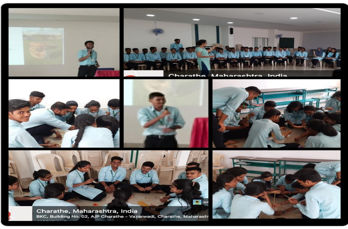
First Year B. Pharm students enjoyed workshop & learnt so many things with Fun and gave positive feedback about workshop