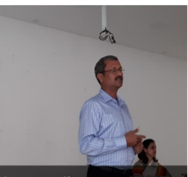
shtra, India Charathe - Vazarwadi, Charathe, M