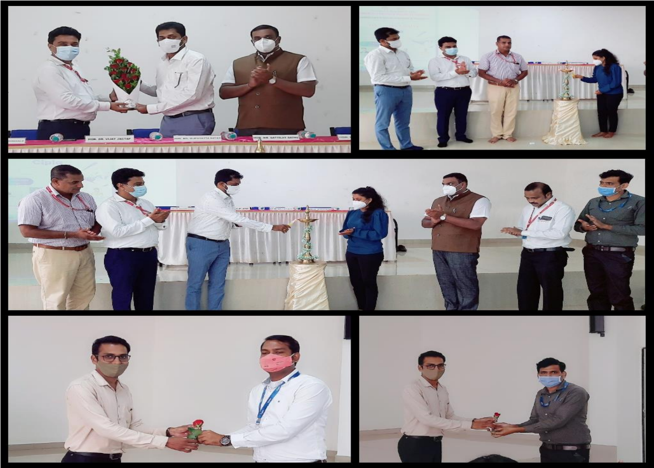
Guests were greeted with floral Bouquet as a token of love