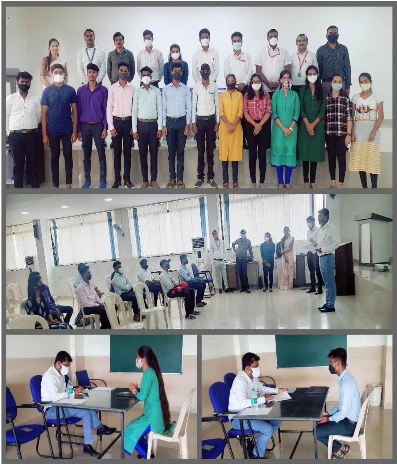
Interview session held by HR Team and Discussion with selected students by HR team