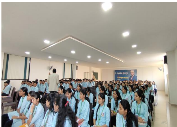
Students & Faculty Audience

Charathe, Maharashtra, India BKG, Building No. 02, A/P Charathe - Vazarwadi, Charathe, Maharashtra 416510, India Lat 15.90385° Long 73.844894° 21/12/23 03:38 PM GMT +05:30 GPS Map Camera Google