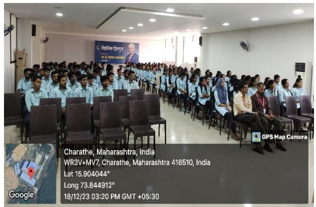
Students & Faculty Audience