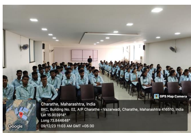
Students & Faculty Audience