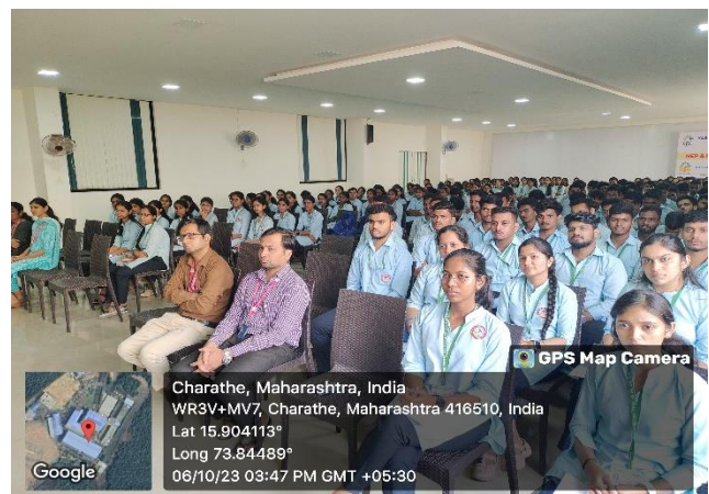
Students & Faculty Audience