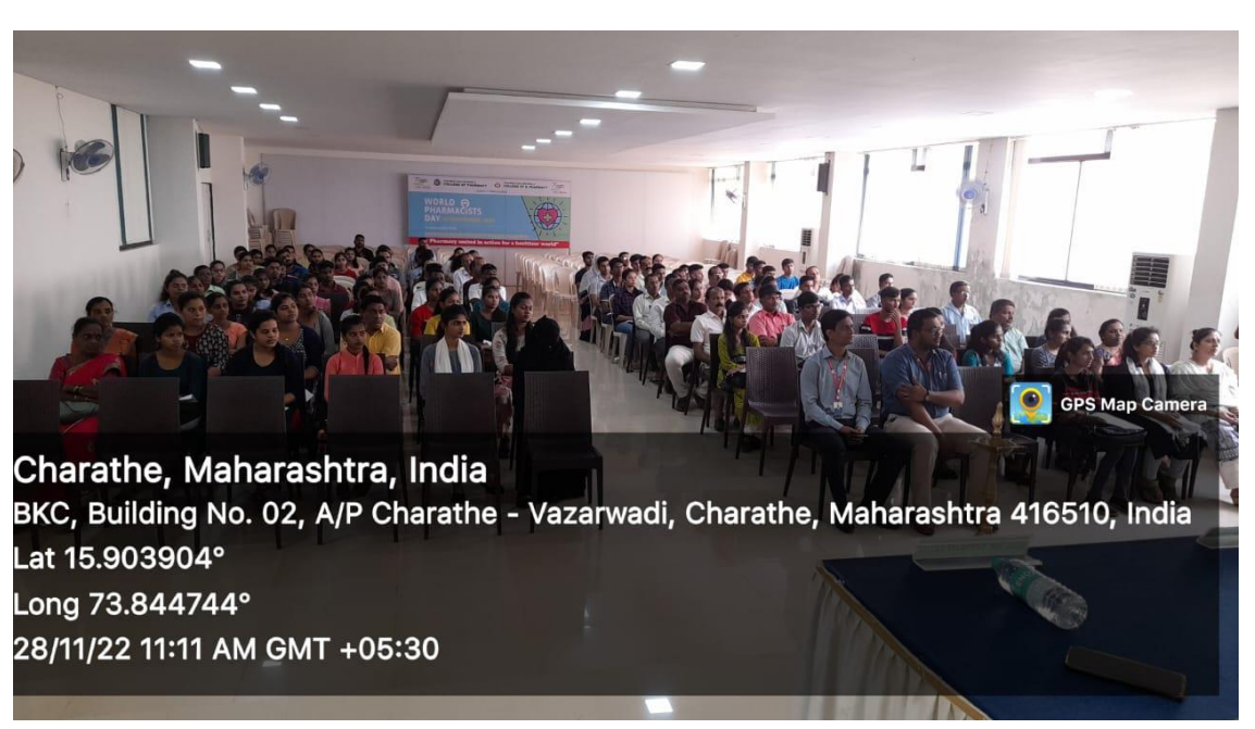
Participants of the event