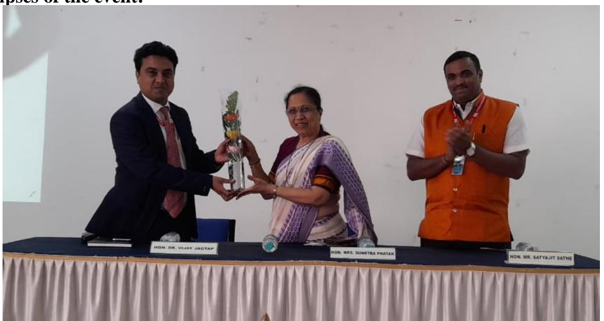
Welcome of the Guest of honor